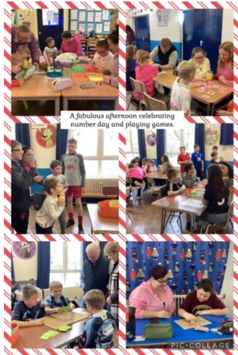
A fabulous afternoon celebrating number day and playing games.

Today our pupils and family members participated in Number Day. They did number related activities and in the afternoon parents came into school to join in! Thank you all for your support and participation which helped to make the day a success!